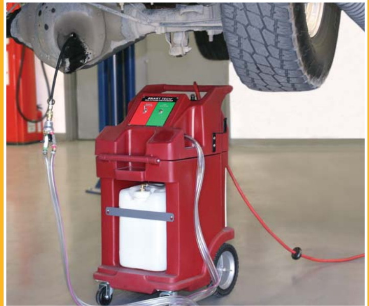
Differential-Fluid Exchange Service

Today's high-torque engines increase the stress and temperature in the drive-train. Coupled with extreme operating temperatures and weather, this can mean depleted drive-train lubricants—to the point of thermal breakdown. Don't fall victim to the varnish and deposits that result from this process! Take the proper precautions to avoid what could be serious pitting and worse yet, corrosion of your vehicle's internal components.