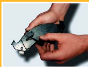
Pads are treated with protective coating