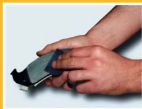
The brake surface is prepared prior to coating

Unfortunately, brake noise is a common side effect due to materials used to manufacture today's brake pads. No one wants to draw attention to themselves with the noise caused by brake drag and squeal. Not only are the vibrations annoying, but the sound is alarming to the driver, passengers, and those who share the road.